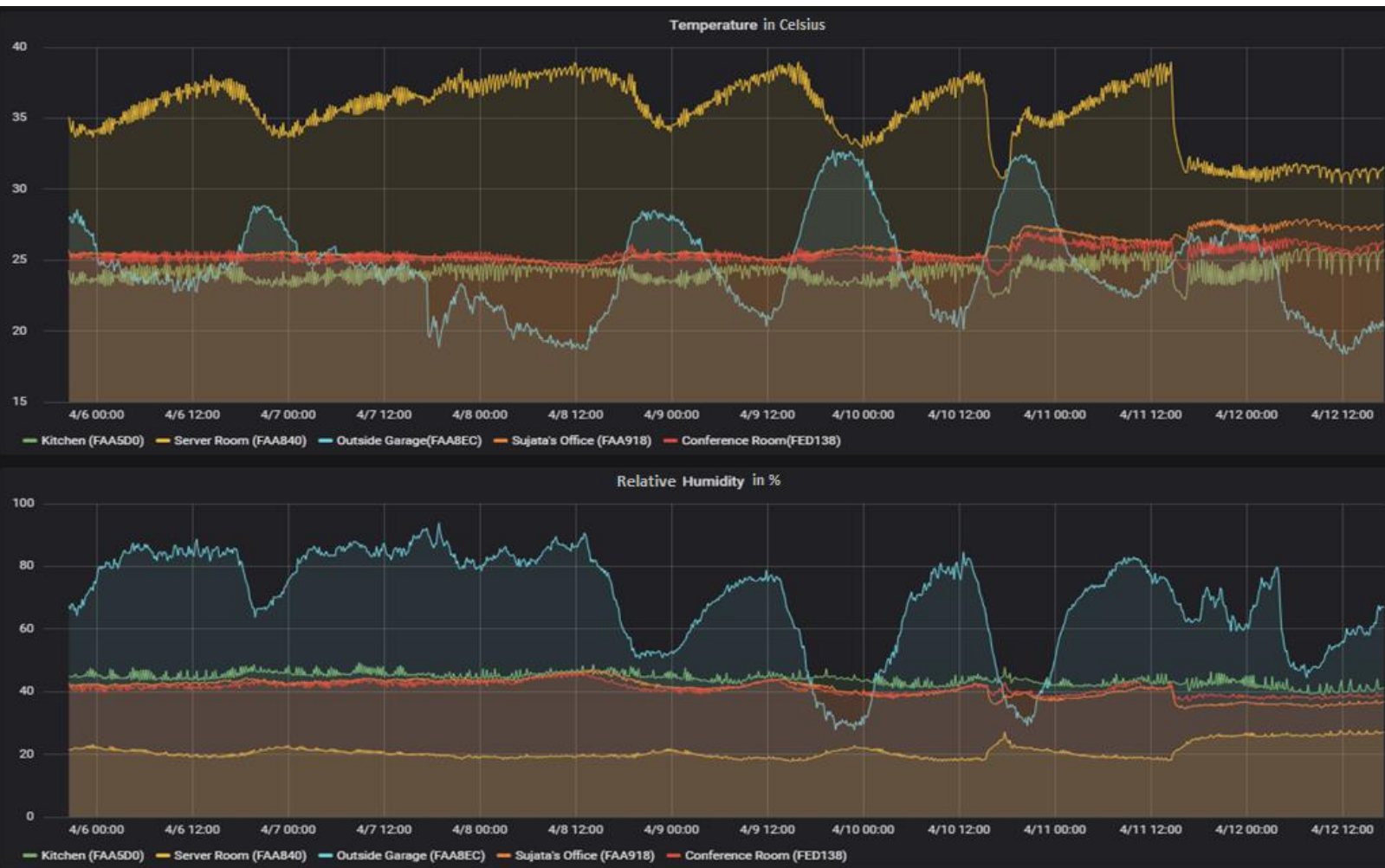
Figure 3: Five Master Kits posting temperature and humidity data from different locations such as Kitchen, Server Room, Outside Garage, office room, Conference room.